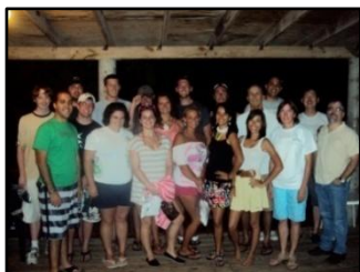
Click image for larger view