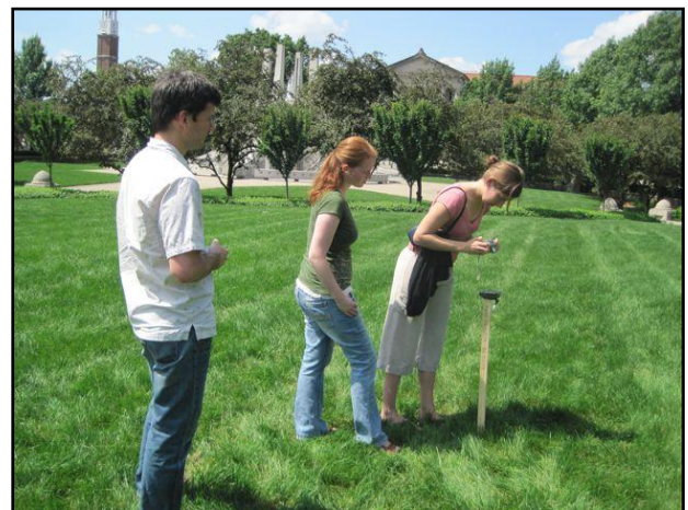
Figure 2: Workshop participants on Purdue campus practicing surveying techniques that will be used to site USArray station locations.